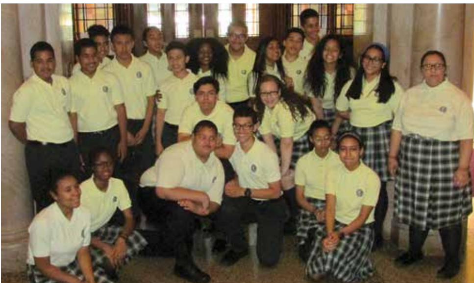
After Mass, the graduating class of 2016 took a group picture in Good Shepherd Church. Congratulations!