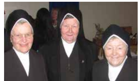
Faithful supporters of the Banquet since its very beginning: a group of Carmelite sisters from St. Patrick's Home in the Bronx.